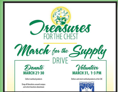
Treasures for the Chest