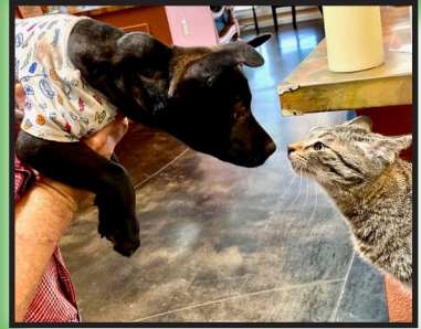
MARC and Animal Harbor