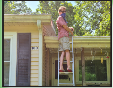
Folks at Home

The Sewanee Community Chest is the Sewanee Civic Association's main philanthropic effort.