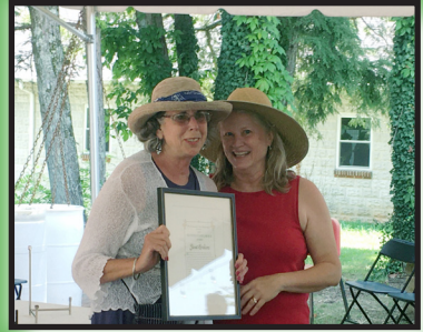
Community Service Award

In 2022, the SCA formed the Treasures for the Chest initiative, a campaign to help promote community-wide service of giving time, support and donations. The first event was a March for the Supply Drive, donating nonfood items to augment the services provided by the CAC food pantry. The SCA worked with Bonner Leaders to update the website. Participated in the Urban Land Institute economic development report.