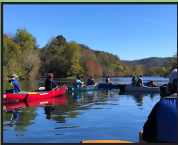
Boy Scout Troop 14