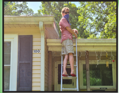
Folks at Home