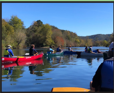
Boy Scout Troop 14