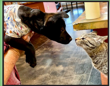
MARC and Animal Harbor