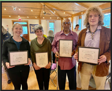
Community Service Award

In 2022, we formed a committee to research ideas on facilitating the relocation of the Sewanee Mountain Goat trailhead from Hawkins Lane to 17 Lake O'Donnell Road. An MOU was signed with the University to turn the premises into the trailhead and as an information resource for community, students and visitors.