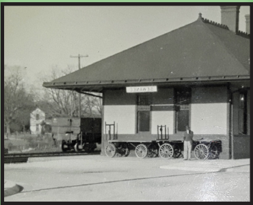
Downtown Historic Sewanee presentation