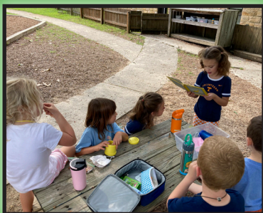
Sewanee Children's Center

The Sewanee Community Chest is the Sewanee Civic Association's main philanthropic effort.