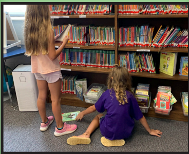
SES Library Renovation