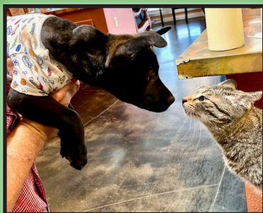
MARC and Animal Harbor