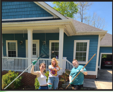
Folks at Home