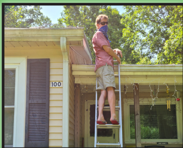
Folks at Home

The Sewanee Civic League—Women organized Sewanee's first