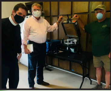
Community Action Committee