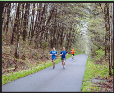
Mountain Goat Trail